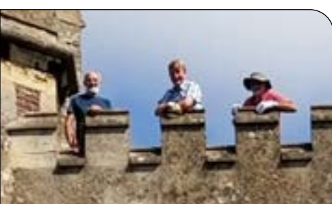
Volunteers Cleaning Church Gutters Not All Volunteers are required to climb onto the roof! Plenty of ground level jobs!

Please ask any of the Churchwardens about helping and they will happily direct you to the relevant person.