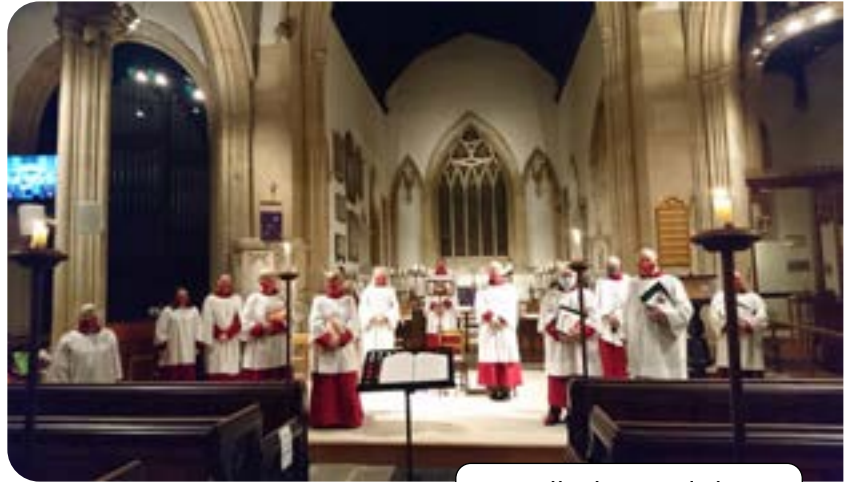
Socially distanced choir!