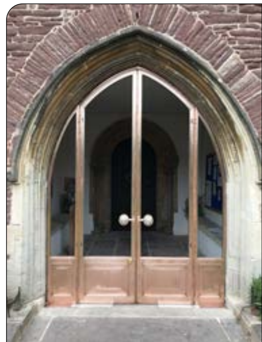
Trial Fitting of new Church Doors We now await the glazing